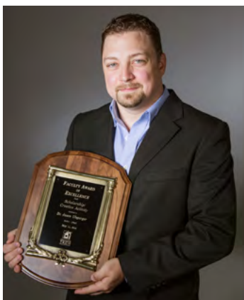
Faculty Award of Excellence for Scholarship and Creative Activity

of Genoa. At Arkansas Tech, she teaches American Studies, American Literature, and Teaching English as a Second Language. She has designed courses in "Global Views of the United States," "Latin@ Experiences in the United States," "Wealth and Poverty in the American Experience," and "Immigrant Literatures." Her teaching aims at developing cross-cultural and global competence and at breaching the gap between university and community through outreach projects.