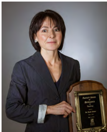
Faculty Award of Excellence for Teaching