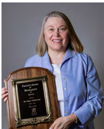
Faculty Award of Excellence for Service

presented his research over 30 times at professional conferences, including meetings sponsored by the Mid-South Sociological Association, American Sociological Association, and International Sociological Association. In addition, he has participated as an editorial reviewer for Sociological Forum , Aging and Society , and the Journal of Contemporary Ethnography . His current research concerns the link between ritualized strain and mass homicide.